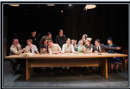
12 Angry Jurors - 2024