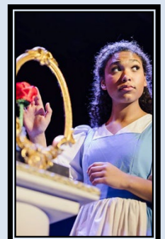
Beauty & the Beast - 2024