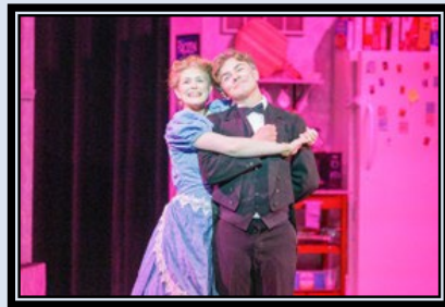
The Drowsy Chaperone - 2025

Synthesize and relate knowledge and personal experiences...relate work with societal, cultural, and historical context to deepen understanding.