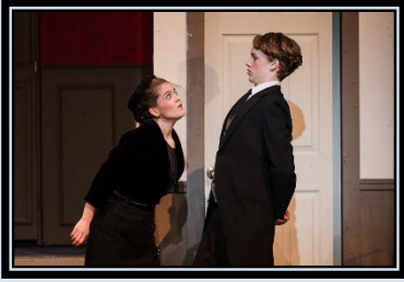
CLUE - 2025

To earn a passing grade in Stagecraft, attend class and actively participate. Be proactive. If you finish a task, find or ask for a new one. Engaged learning points are given on a daily basis . If you are not in class, you will not receive the points for that class regardless of the reason for the absence. Tardies also lower your engaged learning points each day. These points cannot be made up.