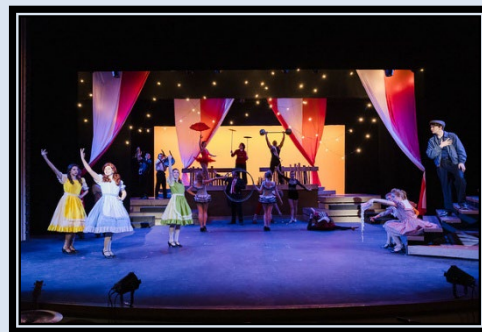
Big Fish - 2023

You may leave your rehearsal/dance clothing in the Green Room in your assigned box and change before class. These boxes are for rehearsal clothing and shoes ONLY . The Green Room is NOT YOUR LOCKER and not a place to store books/bags/or other items not directly related to your theatre class. All clothing and shoes should be clearly labeled with your name.