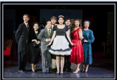
CLUE - 2025

Perceive and analyze...interpret intent and meaning...apply criteria to evaluate artistic work.