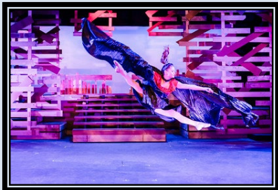
Big Fish - 2023

Select, analyze and interpret...develop and refine artistic techniques...convey meaning through presentation of artistic works.