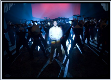
Miss Saigon - 2008