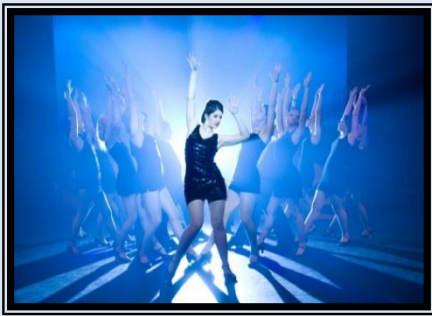
Chicago - 2008