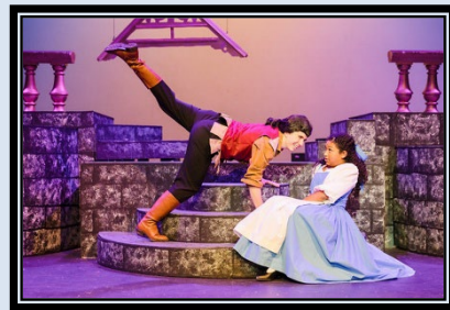
Beauty and the Beast - 2024

Generate and conceptualize...organize and develop...refine and complete artistic work.