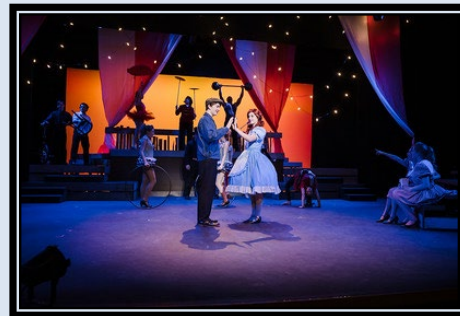
Big Fish - 2023

Because this class focuses on creating characters and physical movement, proper clothing and shoes are required. Students should wear clothing that they can move easily in and feel comfortable sitting on the ground in. Closed toed shoes are recommended. Flip flops, high heels, and other clumsy footwear pose a serious safety risk. If you do not wear appropriate shoes or clothing to school, please bring appropriate attire and change into it before class begins.