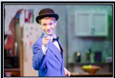
The Drowsy Chaperone- 2025

Synthesize and relate knowledge and personal experiences...relate work with societal, cultural, and historical context to deepen understanding.