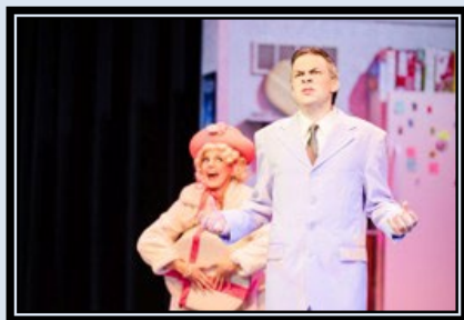
The Drowsy Chaperone – 2025