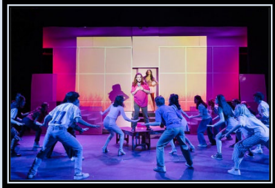
Mean Girls – 2024

Generate and conceptualize...organize and develop...refine and complete artistic work.