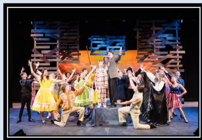
Big Fish - 2023

Perceive and analyze...interpret intent and meaning...apply criteria to evaluate artistic work.