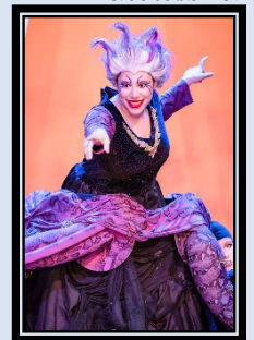
The Little Mermaid - 2022