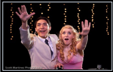
Legally Blonde - 2011

To earn a passing grade in Stagecraft, attend class and actively participate. Be proactive. If you finish a task, find or ask for a new one. Attendance points are given on a daily basis. If you are not in class, you will not receive the points for that class regardless of the reason for the absence. These points cannot be made up.