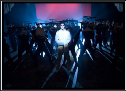
Miss Saigon - 2008