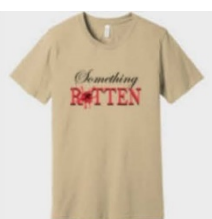
Adult Bella Canvas Soft Cream Favorite T-Shirt $11 USD