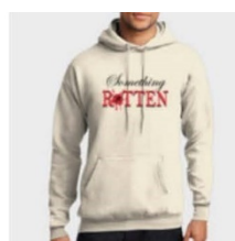
Adult Natural Hoodie $22 USD