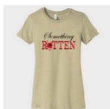
Ladies Bella Canvas Soft Cream Favorite T-Shirt $11 USD