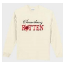
Adult Natural Long Sleeve $15 USD